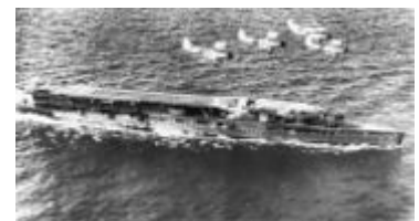
Baffins leave the aircraft carrier "Furious" after being officially withdrawn from service