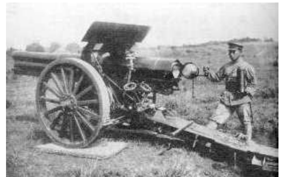
Japanese 105mm Type 38 cannon in action near Kwei Yang: the 1905 design is now obsolete and the licence from Krupp has been cancelled

Japan ART 105mm (3-2) 2xFTR2 2xA5M "Claude" (3-*-*)/5 2xLND3 Ki-21 "Sally" (2-*-1-3)/6E Ki-48 "Lily" (2-*-2-1)/6E 3CVP1 2xA5M4 (3-1-*-*)/5 D3A1 (2-2-*-*)/4 SUB 1922 (2-8)4/4