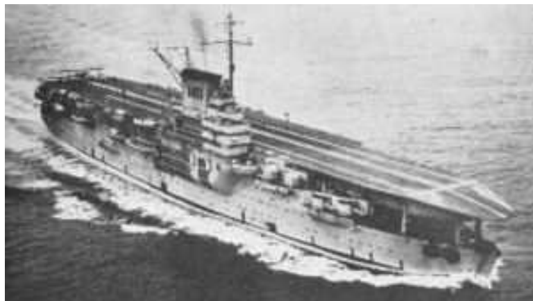
The “Bearn” heads out into the Bay of Biscay, searching for the commerce raiders “Pinguin” and “Michel”

The Admiralty responds to the threat of commerce raiders by issuing its first general alert. Across the globe, dozens of cruisers set sail for the sea-lanes, on the alert for attacks on the vital convoys. La Royale assists by sending the carrier “Bearn” to patrol the Bay of Biscay.