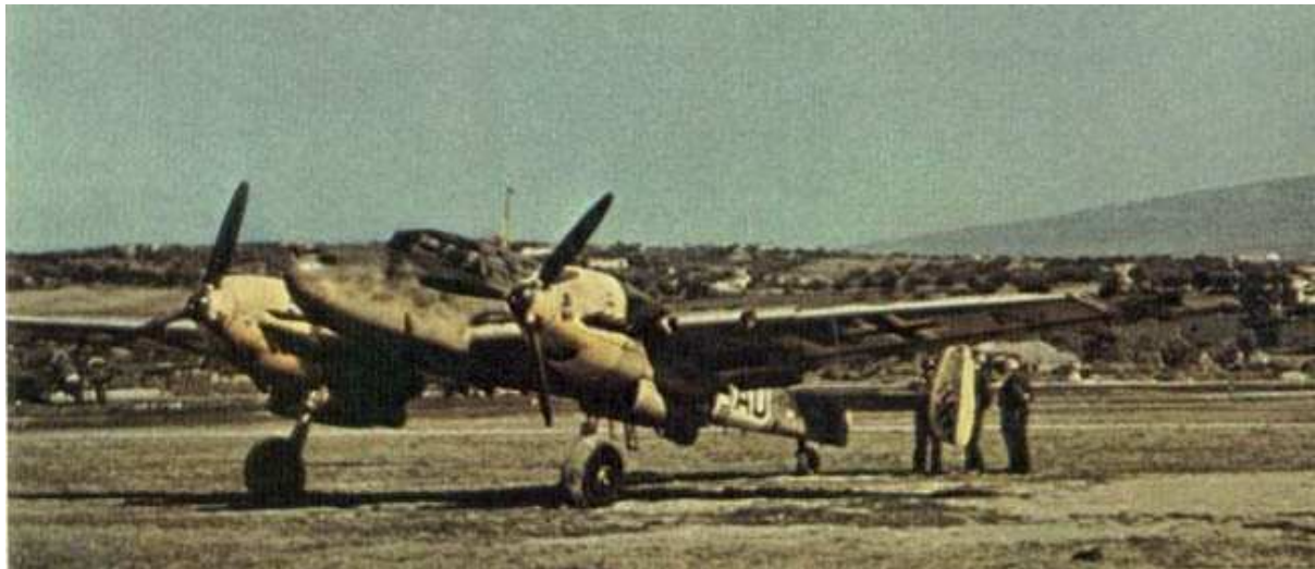
A Bf 110D3 of Fliegerfuhrer Afrika prepares to take off on another mission in the Axis ruled skies of Egypt.

Ethiopian Territorials who support them. After the bombardment, only the Canadians show any cohesion – the rest of the British defence is in tatters as they have no supply link overseas.