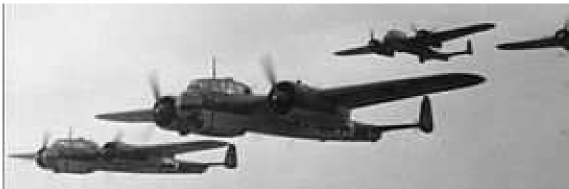
No more “Flying Pencils” will leave the Dornier Flugzeugwerke, as the Do 17Z light bomber is to be replaced by more powerful models such as the Do 217

Germany LND3 Do-17Z (2-1-2-2)/5 2xCVP1 Ju 87B (2-2-1-*)/2 Level 2