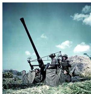
The Bofors 40mm/L60 anti-aircraft gun does not have the hitting power required to knock down the new, more robust Luftwaffe bombers and no more orders will be placed with the Swedish manufacturers.

C/wealth MECH XV (6-6) ART AA “Bofors” (2-4) LND3 Battle (0-1-2-*)/6 Blenheim Mk1 (1-*-2- NAV3 Vildebeest (0-2-1-*)/9 TRS 1935 (0-10-1-0) 4/3