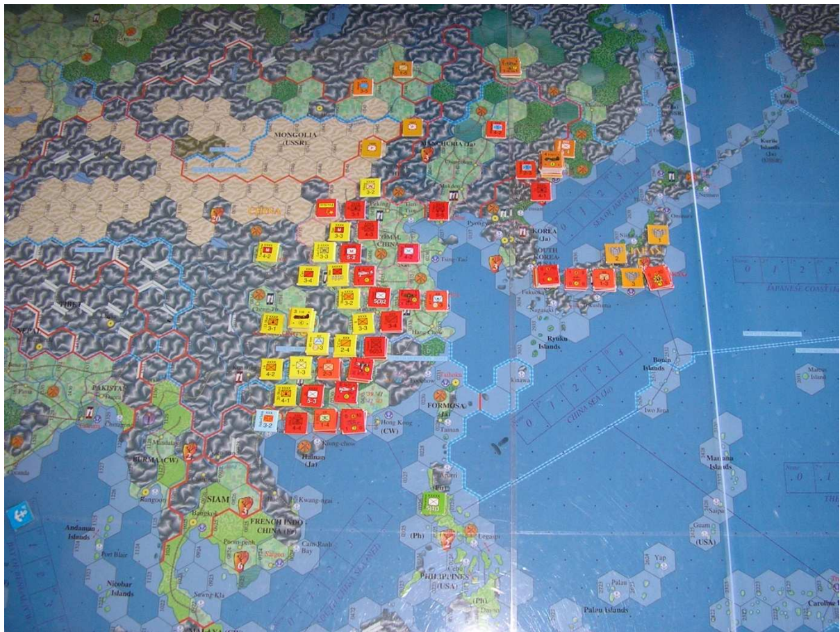
The situation in China before the final assault on Kwei Yang