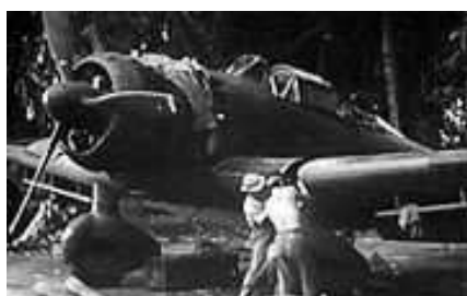
Maintenance crew work on an Aichi D3A "Val" dive bomber. Constant missions over Kwei Yang are taking their toll on equipment

For once the Vals fail to destroy the morale of the defenders of Kwei Yang. Perhaps the forces of the ChungKing warlord are heartened by the presence of regular troops (the Kuomintang's 1 st Division) or perhaps Japanese air power has lost its surprise effect. In any event, this failure has no impact on the result, as the assault is overwhelming. The Japanese have at least an eight to one advantage in numbers, and this superiority is increased by the quality of their troops, artillery support and the ever present air power. In addition, Yamamoto once again uses his headquarters reserve supplies to boost the impact of the attack.