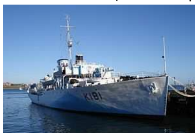
A "Flower" class corvette prepares to leave for sea trials at Halifax in Nova Scotia, Canada. These ships will be the backbone of the Anti-Submarine Warfare groups that the Royal Navy hopes will break the looming U-boat menace.

Kiev MECH 2 (1) INF 29 (1) Moscow HQ(I) Yeremenko (1) Pilot (1) (6) Start prod'n Moscow ARM 2 (3) Odessa LND2 Pe-2 (1) Kiev INF 2 (2) Vitebsk FTR2 I-17 (1) Pilot (1) (8) C/Wealth (16BP) On map Belfast SCS Shipyard (1) NE Liverpool Synthetic Oil plant (1) (2) In production London HQ(I) Alexander (1) Glasgow FTR2 Hurricane (1) 2xCA "Mauritius", "Kenya" (1) Leeds LND2 Battle (1) Belfast CV "Victorious" (1) NAV3 Beaufort (1) 2xPilot (2) (8) Start prod'n London LND3 Hampden (1) Edinburgh Synthetic Oil plant (3) 2xPilot (2) (6) Canada In production Ottawa MOT 1 Canadian (1) Start prod'n Halifax ASW (from const pool) (1)