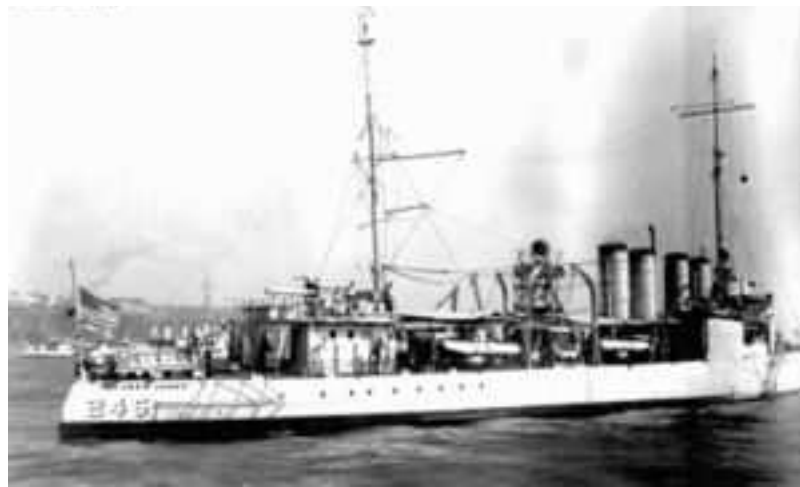
President Roosevelt’s “Neutrality Patrol” swings into action as the USS “Reuben James” (DD 245) heads out of the Hudson River to begin escort duties off the eastern seaboard and Gulf ports of the USA

Finally, although Germany has not as yet attacked any Allied shipping, Congress authorises the US Navy to escort Allied convoys off the east coast of the USA. The number of ships involved is limited, and the rules of engagement limit actual combat to clashes involving merchant shipping. Germany ignores the Bill. ( dr = 8, 7 needed ).