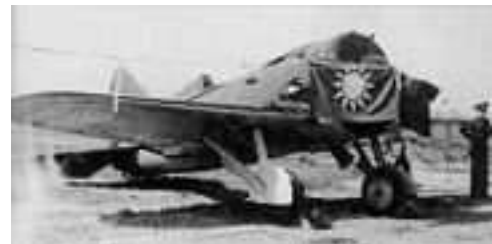
A Kuomintang I-16 at Kunming air field, having arrived from ChungKing

More Chinese units move to shield Kunming. The entire air force rebases to the city, intending to drive off the ubiquitous Japanese bombers.