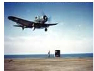
Fresh from the factory, an SBD-4 "Dauntless" practices take-off and landing on the "Wasp"