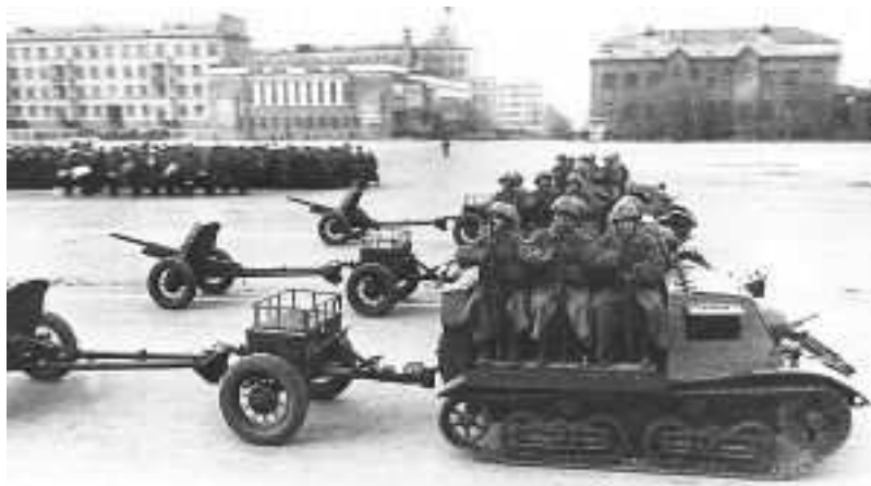
In the bitter cold of April 1940, T20 artillery tractors towing 45mm anti-tank guns arrive in Kiev to join the 2 nd Mechanised Corps

USSR (14BP) In production Leningrad Odessa INF FTR2 6 (1) I-16 (1)