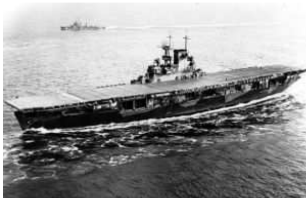
The newly commissioned USS "Wasp" (CV-7) heads out of Los Angeles harbour to join the Pacific fleet.