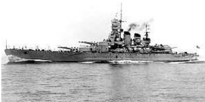
The "Vittorio Veneto" with her 3 turrets each mounting three 15in guns, joins the Regia Marina. Italy is staking her claim to the Mediterranean