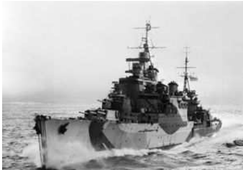
HMS "Birmingham" at full speed in pursuit of the raiders "Michel" and "Penguin". She will claim the first naval success of the war.

The raiders "Penguin" and Michel" do not need the cover of the rain as they leave Lisbon and head south, evading the carrier fleets in the Bay of Biscay and off Cape St Vincent. They head down the coast of Africa, searching for ships on the Cape Town to Plymouth route. A lone cruiser does not deter their search, but in a brief clash, HMS "Birmingham" sinks the auxiliary cruiser "Michel". The "Penguin" manages to break contact and remains in the area, hoping to find less dangerous prey next time.