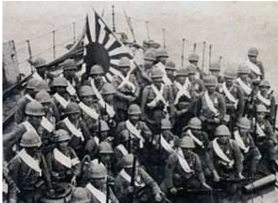
Marines of the Special Naval Landing Forces in training off Osaka