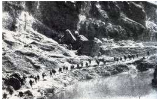
Chinese troops struggle forward to the front in the southern mountains

The Chinese take advantage of a lull in the fighting to reinforce the front. Despite the snow and rain they manage to replace all the losses sustained in the previous attacks, although the effort required to travel such distances in the cold, wet conditions mean that some of the freshly arrived units are not combat ready.