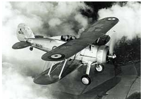
A Gloster “Gladiator” – the biplane will now only be used for naval operations

With regret, the Royal Air Force advises Gloster that it will no longer accept the “Gladiator” fighter. (FTR2 (3-*-*)/4) Evaluation indicates that the bi-plane will not be effective against the newer monoplanes.