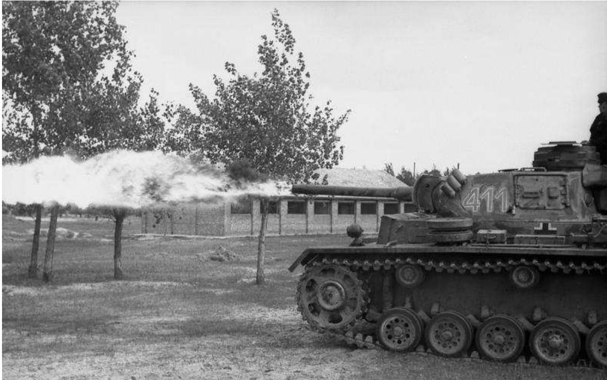
A "Flammpanzer" (a modified Panzer III Ausf. M) undergoes testing before it joins the XXIV Armoured Korps in Prague. 1942 will be the last full year of production for the Panzer III, as it is now outmatched by the best Russian tanks. The Panzer IV will replace it as Germany's main battle tank.