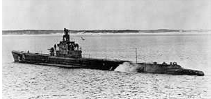
USS Snook (SS-279) cruises past Christmas Island.

The only offensive actions are taken by US submarines. Newly commissioned subs leave the West Coast of the USA and reach the vicinity of Christmas Island. Another group in the East Indian Ocean locates the Japanese supply convoys and sinks several dozen ships (2CP). While long range submarines do make it to the China Sea, the sub commanders note the size of the Japanese escort fleets and decide to hold action.