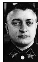
Marshal of the Soviet Union Mikhail Tuchachevsky