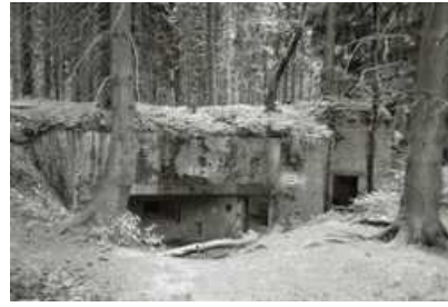
V Corps finally sees the rear view of a Siegfried Line bunker

The French Army, taking advantage of the German concentration in the East, launches a surprise attack on the Siegfried Line. Facing annihilation, the LXVIII Garrison Corps attempts to withdraw but is overwhelmed by the French assault, inflicting only slight casualties on the attackers (1BP). The French V Corps advances into Germany.