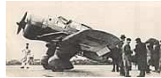
Inspecting an interned PZL.23 light bomber

2xMIL Lodz (3-2) and Warsaw (4-2) overrun while mobilising