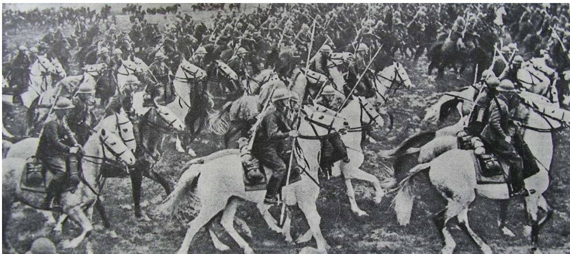
The last charge of the Tarnow cavalry corps