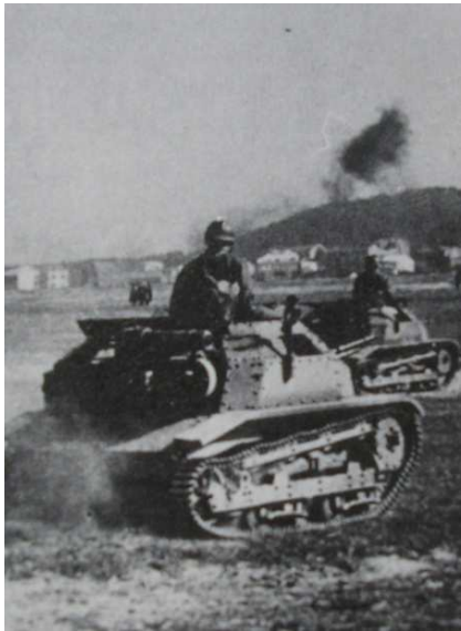
TK3 tanks of the Pomorze Army in the vain counter-attack

General von Bock decides to eliminate the threat to his flank and commits his mechanised units to quickly smash the Poles out of the way. Outnumbered, the Pomorze Army launches a desperate counter-attack. The defenders are overwhelmed, but the LXIII Korps takes heavy casualties (2BPs).