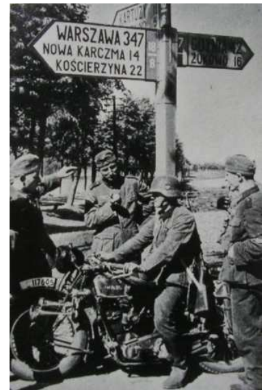
Through the front lines and onto Warsaw

The rest of the Polish Army, however, shows less resistance. Both Krakow and Poznan fall to assaults, and the Karpaty army is encircled and wiped out. No losses are taken by the attackers.