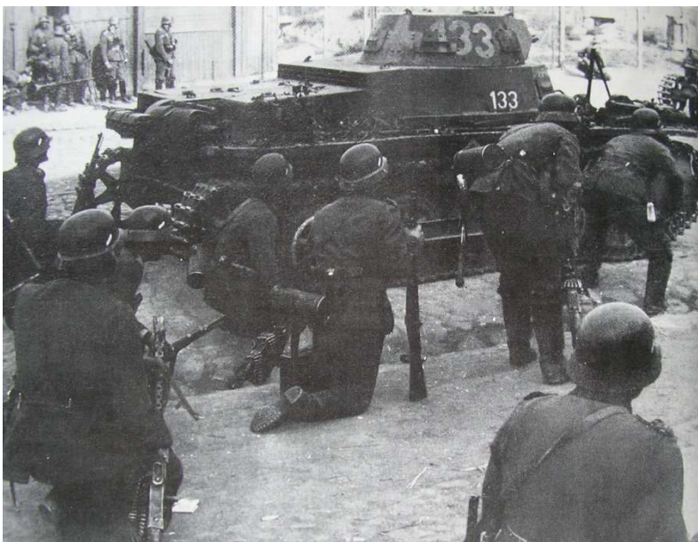
Von Bock's troops make their final careful assault on Warsaw

In driving rain, von Bock launches the final assault of the Polish campaign. The attack is flawless and despite an attempt at a counter attack, Warsaw falls without loss to the attacker.