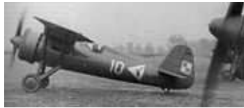
PZL P11c lands in Rumania

FTR2 PZL.P11 (3-*-*-* ) and LND2 PZL.23 "Karas" (1-1-3-*) interned in Rumania (pilots to UK)