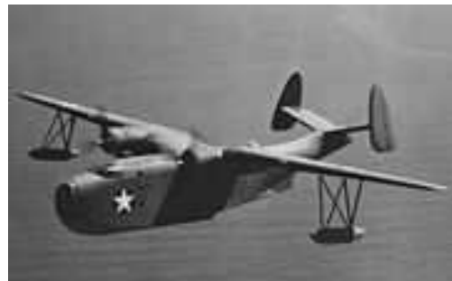
President Roosevelt's intervention in the Battle of the Atlantic will be assisted with the arrival of squadrons of Martin PBM "Mariner" (above) and Consolidated PB1Y "Catalina" flying boats (left).