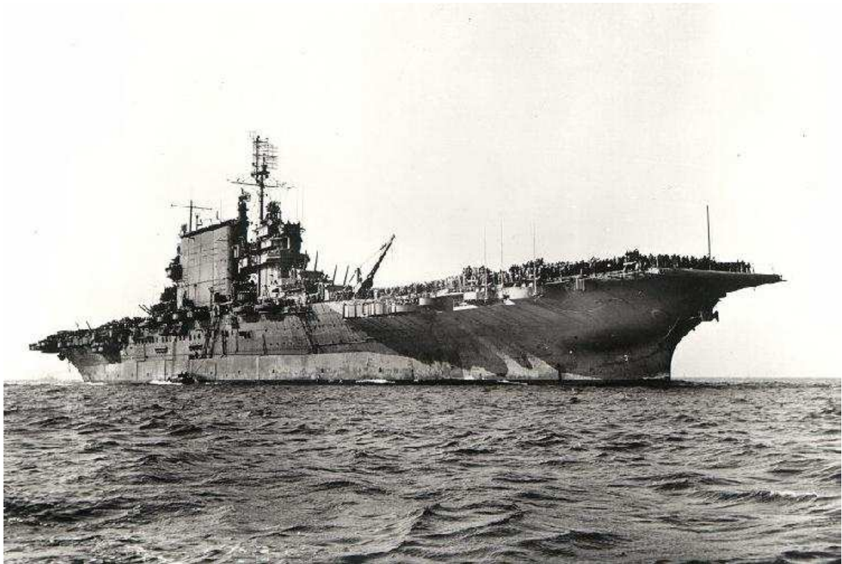
The crew of CV-3, the USS “Saratoga”, line the deck of the carrier as she heads into the Atlantic on anti-submarine patrol. Morale is high despite the news of the loss of the “Trenton” on a similar mission.

With anger over the sinking of the “Trenton” still high, the carrier USS “Saratoga” leaves Annapolis to join two Canadian anti-submarine groups on escort duty in the Central Atlantic.